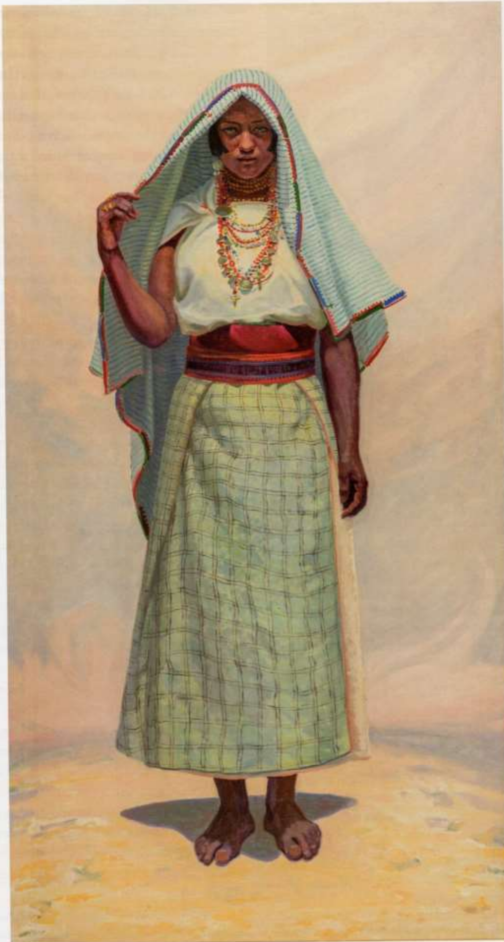
Fig. 18. Víctor Mideros, Indian from Zambiza . Ecuador, c. 1925. Oil on canvas, 74 x 39½ in. (188 x 99.6 cm). Fondo de Arte Moderno-Contemporáneo del Ministerio de Cultura y Patrimonio del Ecuador, Guayaquil.