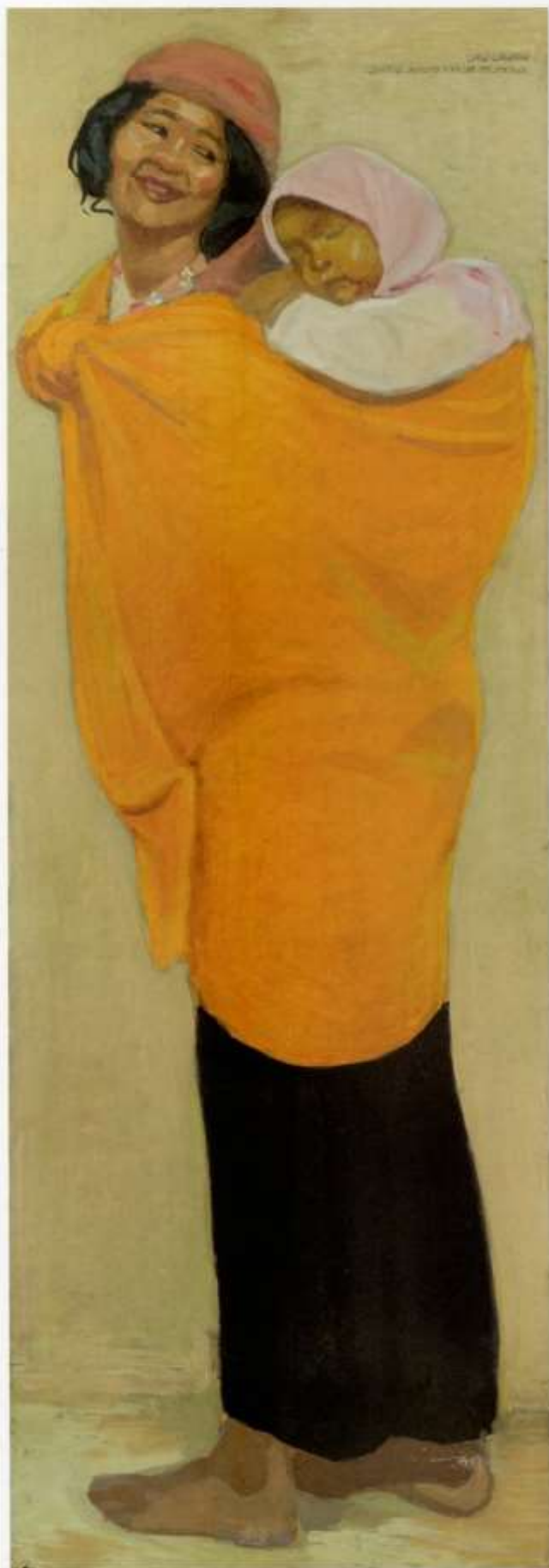
Fig. 17. Luigi Cassadio, Indian Mother . Ecuador, 1928. Tempera on cardboard, 39 \frac{1}{3} x 13 \frac{1}{2} in. (100 x 34 cm). Museo de la Casa de la Cultura Benjamín Carrión, Quito.

Mera's (1832–1894) compilation of popular poetry published in 1892 as Cantares del pueblo ecuatoriano . In this case, artists and writer were focused upon dignifying and preserving popular culture in a society that was starting to change dramatically. Modernity was on its way, as was a feeling of the loss of an arcadian life on the part of local Romantic artists, whose minds and hands exoticized the indigenous and popular communities with their closeness to Mother Earth and their moaning music and verses.