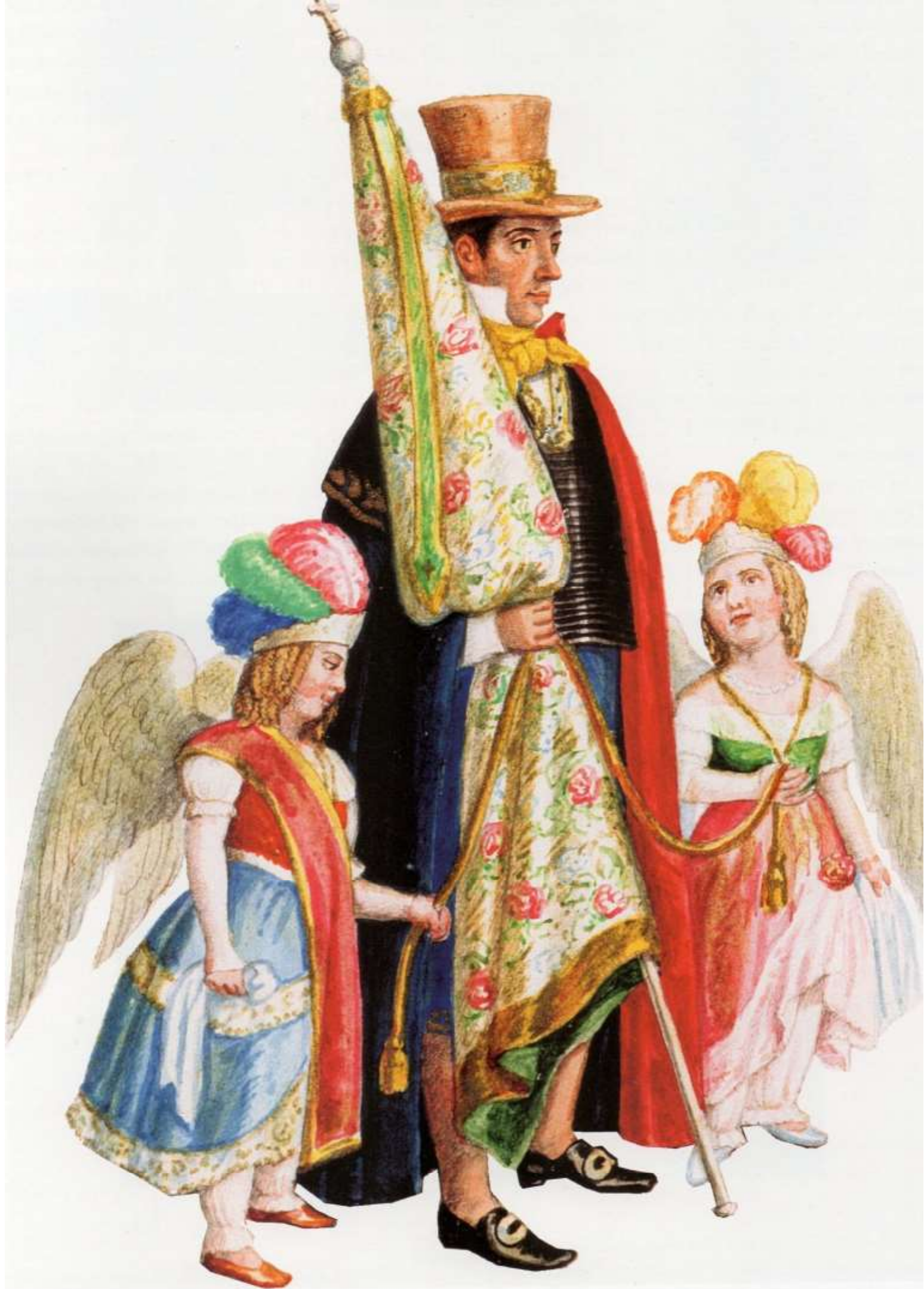
Fig. 7. Ramón Salas, Indian Governor Carrying the Standard . Ecuador, c. 1855–1865. Watercolor on paper. From Album ... Biblioteca Nacional de España inv # 15-90. Madrid. Reproduced in