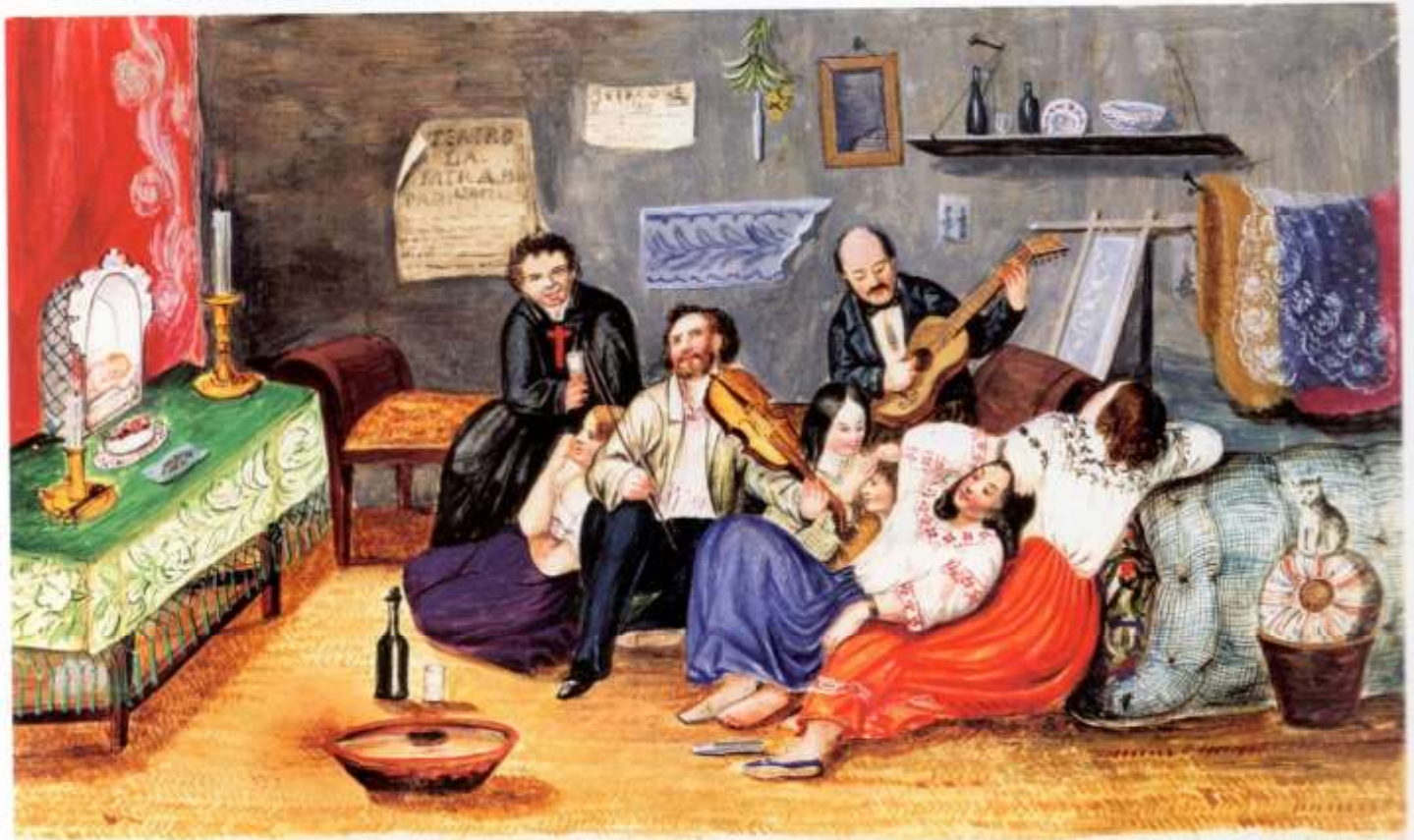
MISA DEL NINO

Some of the watercolors inserted in the album appear to have been commissioned by local intellectuals. These have to do with specific political events or are more general political satires, criticisms of Catholic priests and their abuses, such as “What Happened on April 13th, 1852” (fig. 12), “Child Jesus Mass” (fig. 13), “Satire of the Republic in the Times of (President) Urbina” (fig. 14), and “The Executed” (fig. 8). 19 They are intermingled with other images of Indian types or costumes, which, if seen in a decontextualized fashion, we could think of as symbols of the