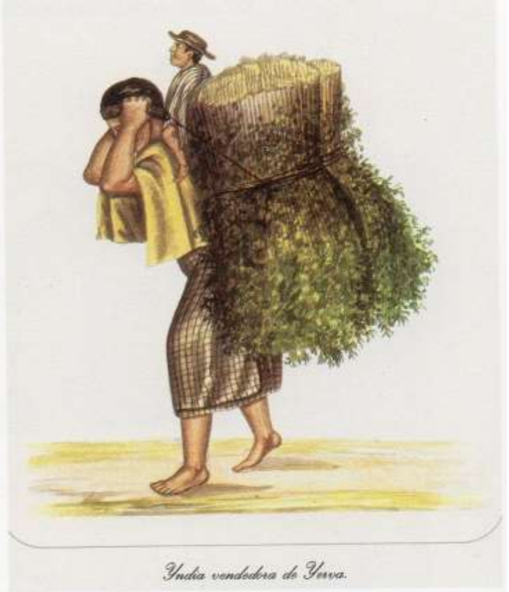
Fig. 4c. Juan Agustín Guerrero, Indian Herb Vendor . Ecuador, 1852. Watercolor on paper. From Imágenes del Ecuador siglo XIX. Juan Agustín Guerrero 1818–1880 , texts by Wilson Hallo (Quito/Madrid: Ediciones del Sol/Espasa-Calpe, 1981).