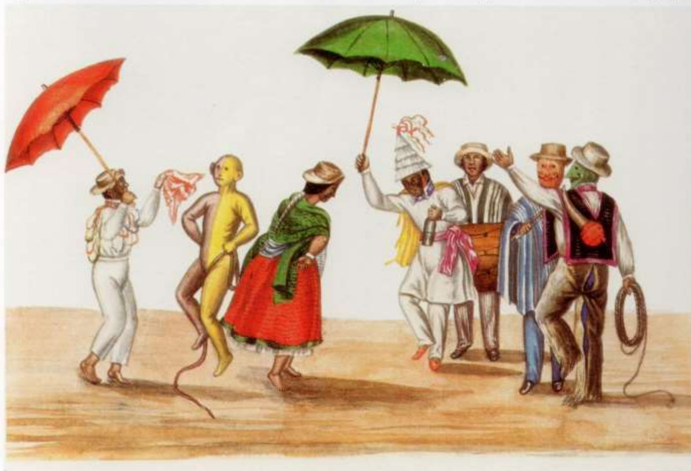
Danza de Indios disfrazados en día de Reyes.