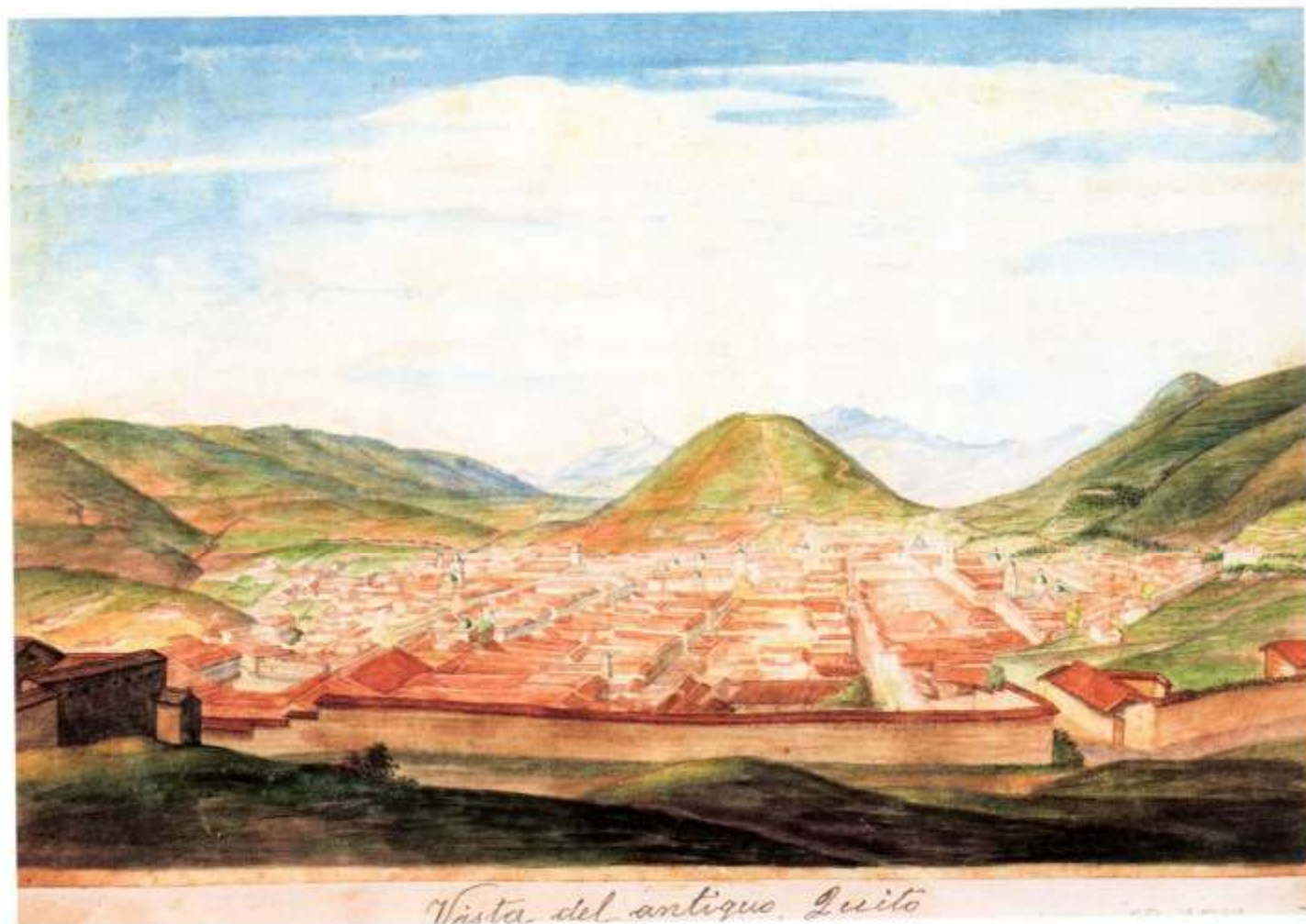
Fig. 11. Ramón Salas, View of Old Quito . Ecuador, c. 1855–1865. Watercolor on paper. From Album de costumbres ecuatorianas: paisajes, tipos y costumbres , Biblioteca Nacional de España, inv.# 15-90, Madrid. Reproduced in Imágenes de identidad. Acuarelas quiteñas del siglo XIX , ed. Alfonso Ortiz, Biblioteca Básica de Quito 6 (Quito: FONSAL, 2005), 163.

This “regional” album portraying craftsmen and free peasants, administrators, and traders from the highlands of Ecuador north of Quito becomes a sort of national manifesto. The nation considered