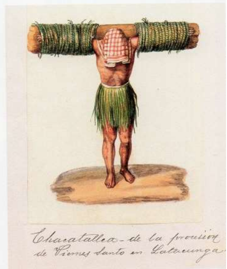
Fig. 5. Ramón Salas, Chacatallica in the Holy Friday Procession in Latacunga . Ecuador, c. 1855–1865. Watercolor on paper. From Album de costumbres ecuatorianas: paisajes, tipos y costumbres , Biblioteca Nacional de España, inv.# 15-90, Madrid. Reproduced in Imágenes de identidad. Acuarelas quiteñas del siglo XIX , ed. Alfonso Ortiz, Biblioteca Básica de Quito 6 (Quito: FONSAL, 2005), 274–275.