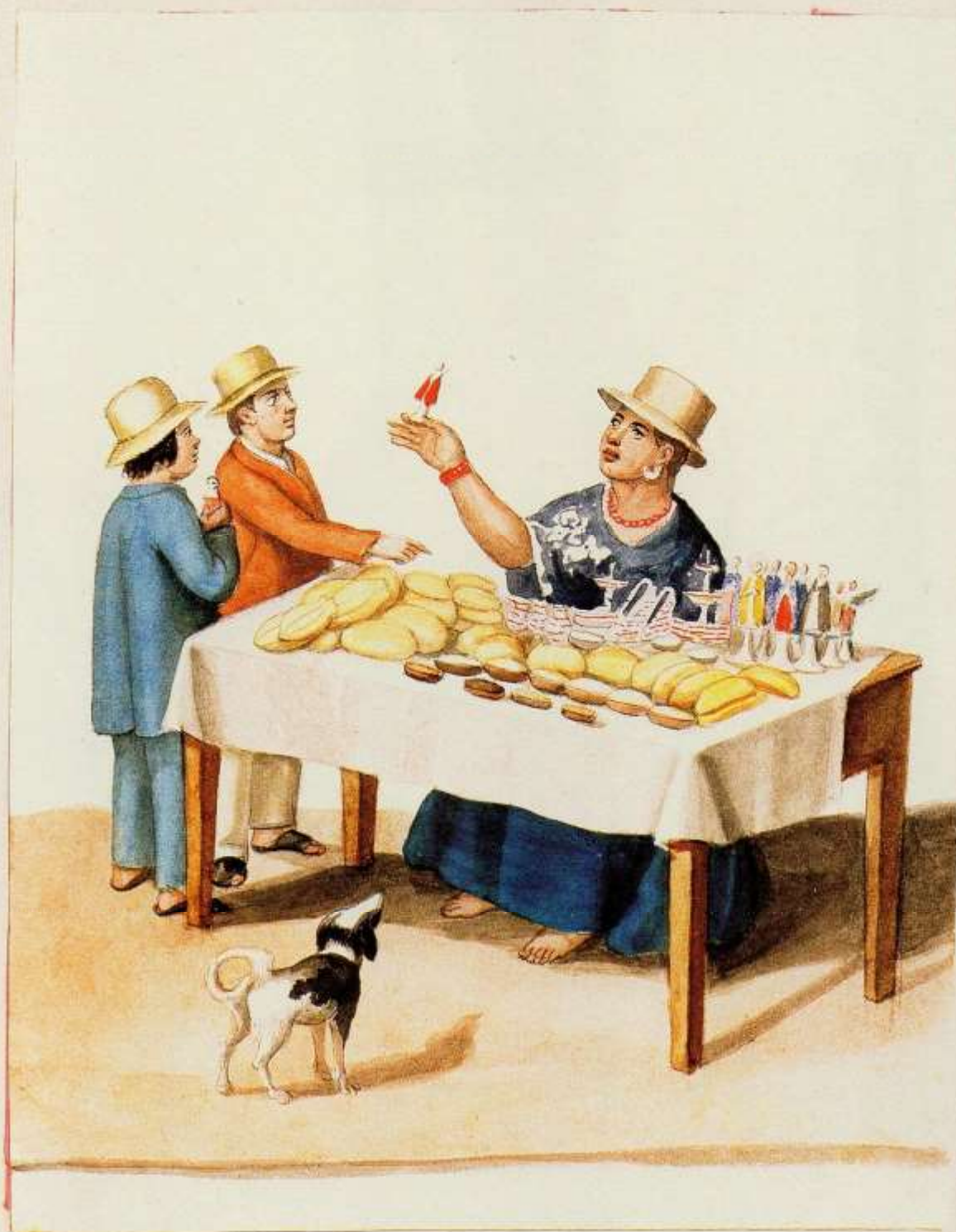
La mesa con figuritas en la fiesta del Patriarca